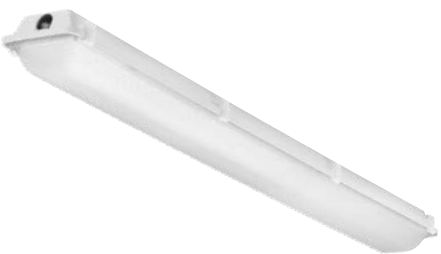
Luminaire (shown with LRA lens)